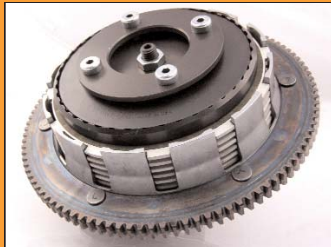
CC-130-BB installed in a stock Harley clutch basket