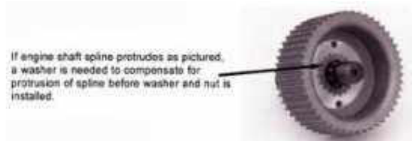
Fig. 7 When using any of the BDL inserts with special nut, please note that the nut is counter-bored to cover the splines should they protrude. COVERING THE SPLINE IS VERY IMPORTANT

Engine shaft spline should not protrude from pulley. Be sure to red Loctite® front engine nut and torque to HD specifications. (Electric impact is preferred). (Fig. 7)