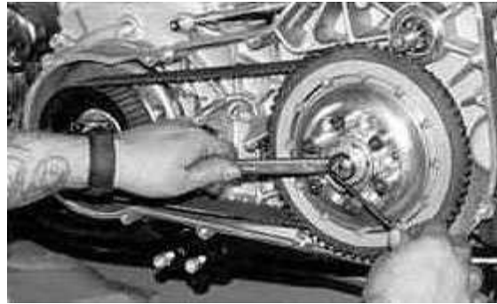
Fig. 11 Install clutch adjusting rod supplied with kit 1986-up. and adjust clutch.

14. Clutch screw adjustment. should be approximately 1/4 turn loose from lightly seated. (Note when clutch is hot the adjustment screw should not be seated). Tighten rod nut when adjustment is complete. (We supply a clutch adjusting rod and nut for all models 1990-up only). (Fig. 11)